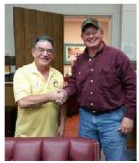
Houston Lions treat local police to lunch