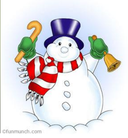
Merry Christmas and Happy New Year