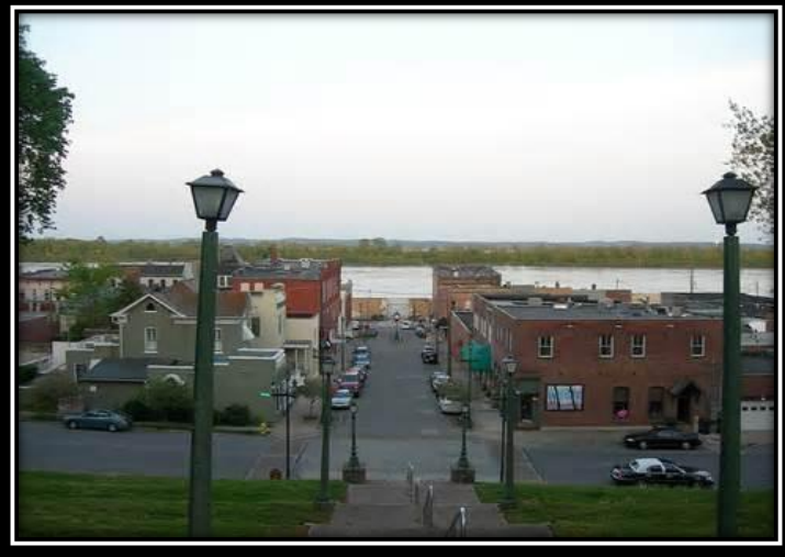
Check out the website and get prepared for the 2015 Missouri Lions State Convention! Watch the special invitation video for this event.