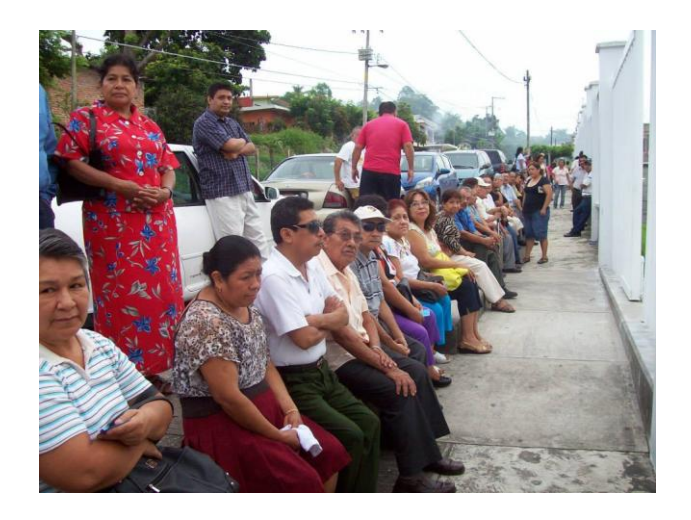
Long lines wait patiently hoping to have better vision.