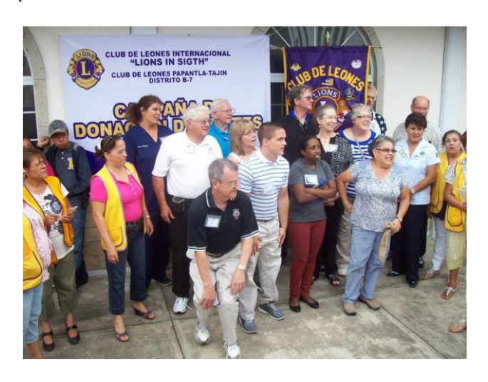
Lion Club Volunteers in Vera Cruz, Mexico