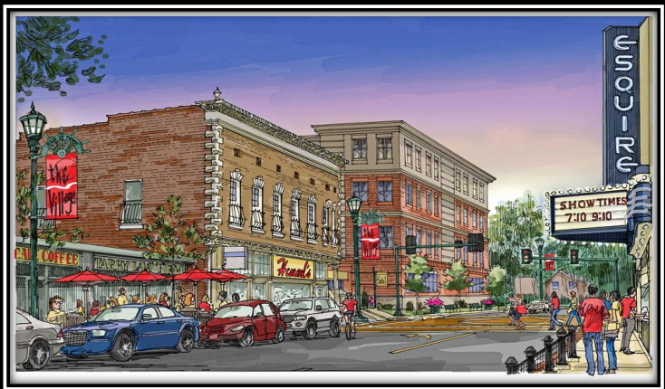
Come to the 93<sup>rd</sup> Missouri Lions State Convention and enjoy historic Cape Girardeau, MO.