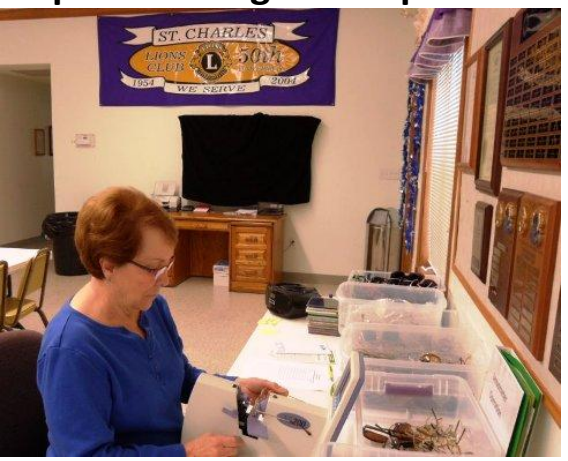
Step 5: Reading Prescriptions