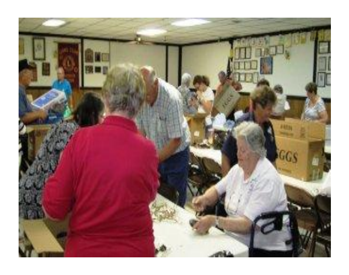
Step 4: Washing and Drying

Glasses are separated from cases and loose lenses.