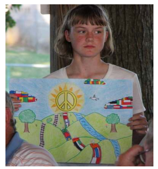
East Perry County Lions Peace Poster winner #1