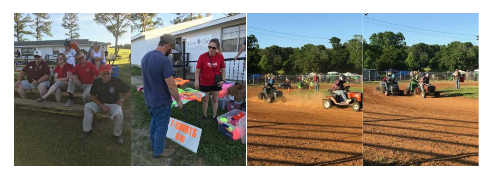
Patton Lions Club holds Lawn Mower races

Patton Lions club opened its much-delayed season of lawn mower races Saturday June 13. Over 50 competitors brought their "racing mowers" to the track and entertained an enthusiastic group of spectators. Turnout was a little lower than usual as this was the club's first race of the year, the COVID-19 restrictions having resulted in the cancellation of all April and May events. Patton Lions members expect the spectator count to return to near normal for the next event, which will also feature a fire-works display. The lawn mower races are the club's biggest fundraiser, and there will one again be a nationally sanctioned mower race this fall!