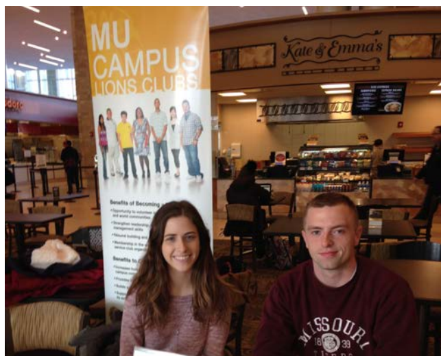
MU Campus Lions at the involvement fair

The Mizzou Campus Lions club recruited new members at the Spring 2018 involvement fair at the student center on campus. They got a lot of interest in the club and hope to see their numbers grow!