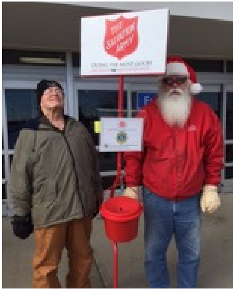
JC Evening Lions