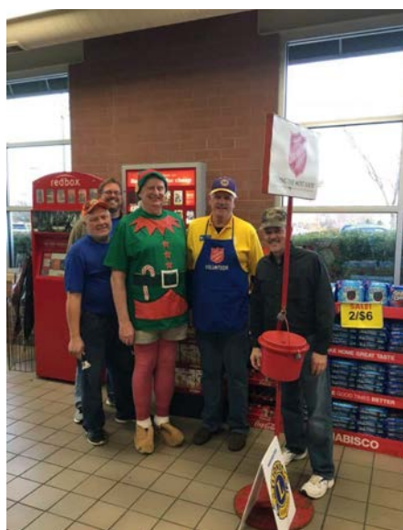
Harvester Lions Club