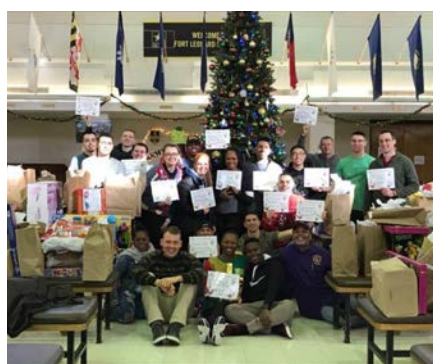
Fort Leonard Woods Lions