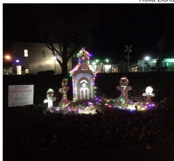
St. James Lions