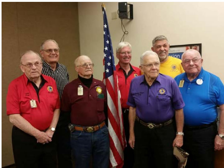
Veteran Lions honored at the district cabinet meeting