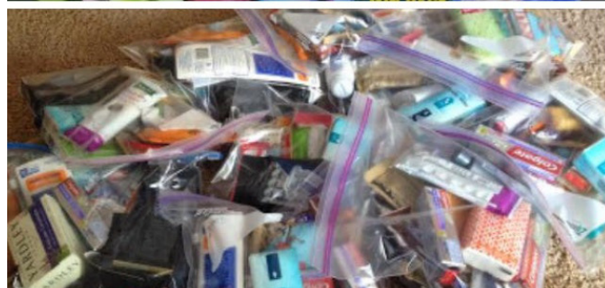
Supplies donated to Lions closets