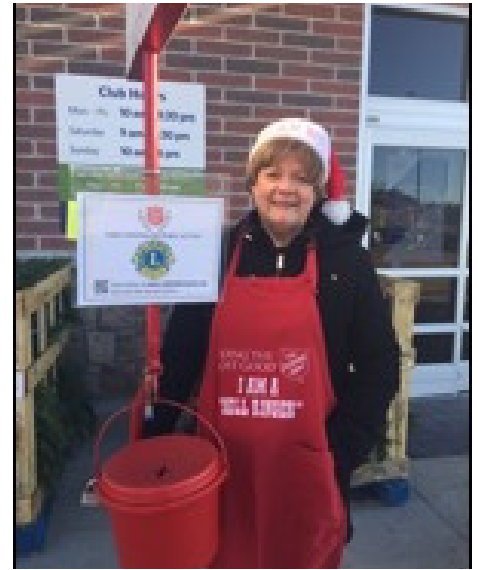
26-M7 District Governor