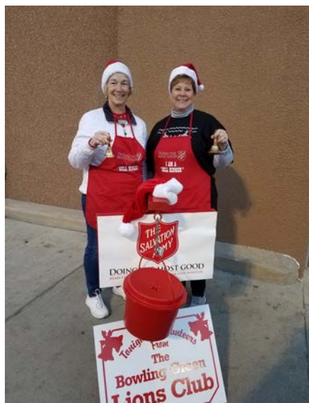
Bowling Green Lions Club