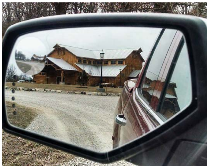
The Mighty Oak Lodge, site of the March District Convention

District Governor Kevin is thrilled about this unusual venue for the convention and hopes to have many Lions roaring in for all the Convention activities!