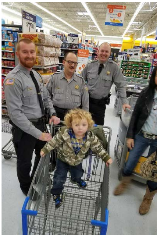
Houston and Licking Lions