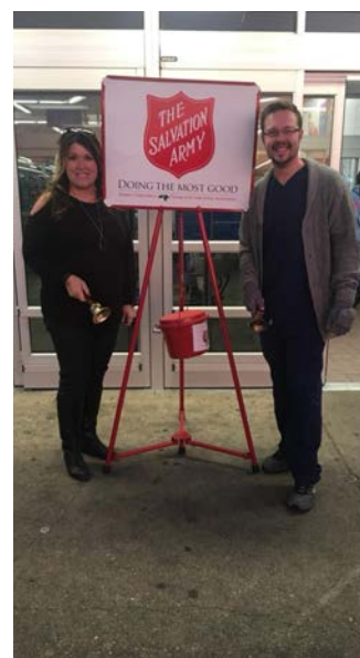
West Plains Lions