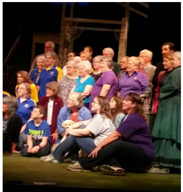
M6 Lions are recognized on stage with the cast of the Miracle Worker

Springfield Little Theatre presented The Miracle Worker, the story of Helen Keller. M6 Lions thought it was a great opportunity to get together and have some FUN! 47 Lions attended the play for a wonderful evening. The Lions were recognized at the event for accepting Helen Keller's challenge to be "knights of the blind". This is proof that although we work and serve as Lions, there is always time for a little fun and enjoyment!