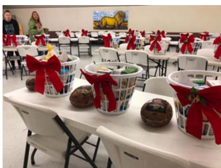
NorthWest Texas County Lions

The Fort Leonard Woods and NorthWest Texas County Lions gave back to their community by making sure everyone had what they needed during the holiday season (left)