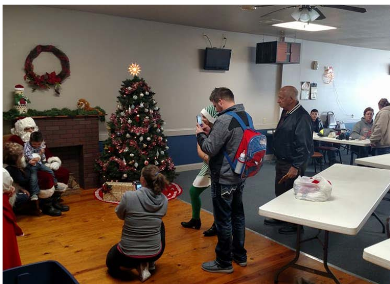
Children wait in line for photos with Santa