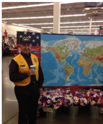
Liberty Lions serving breakfast